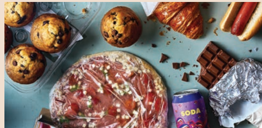
Limit foods high in sodium, sugars or saturated fat